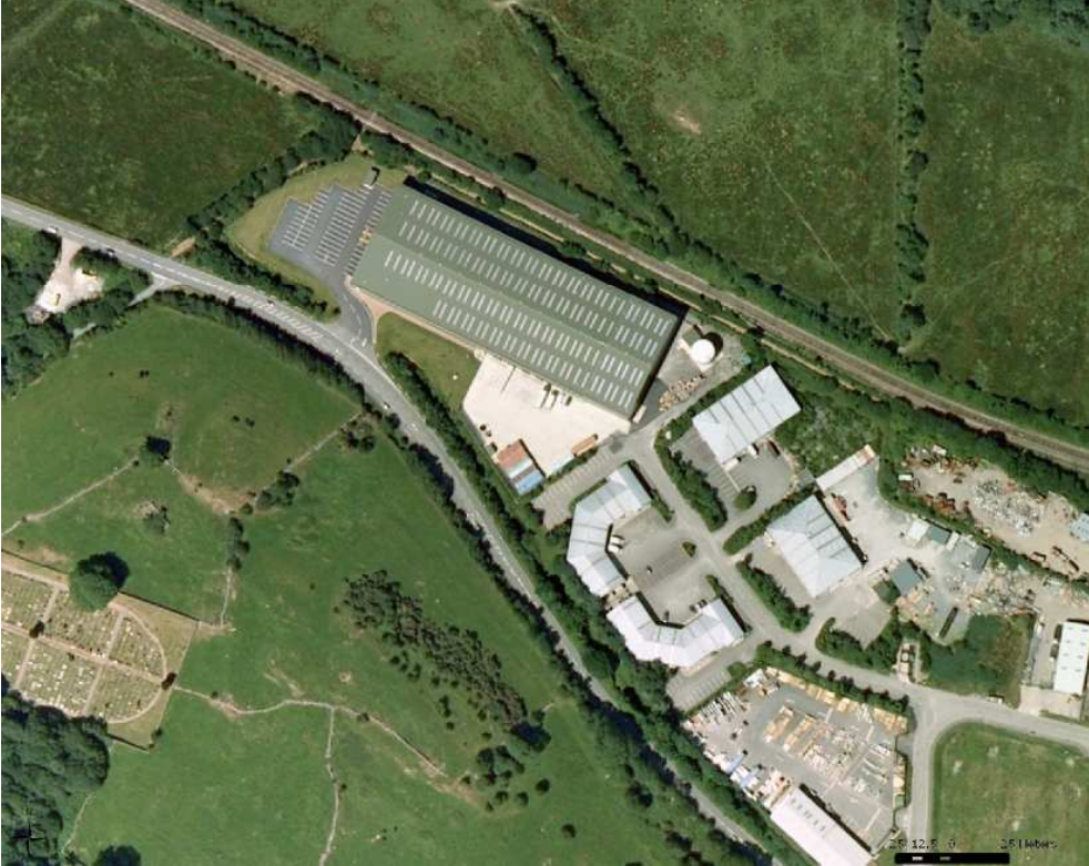
Aerial photographs of the site before and after building the warehouse.